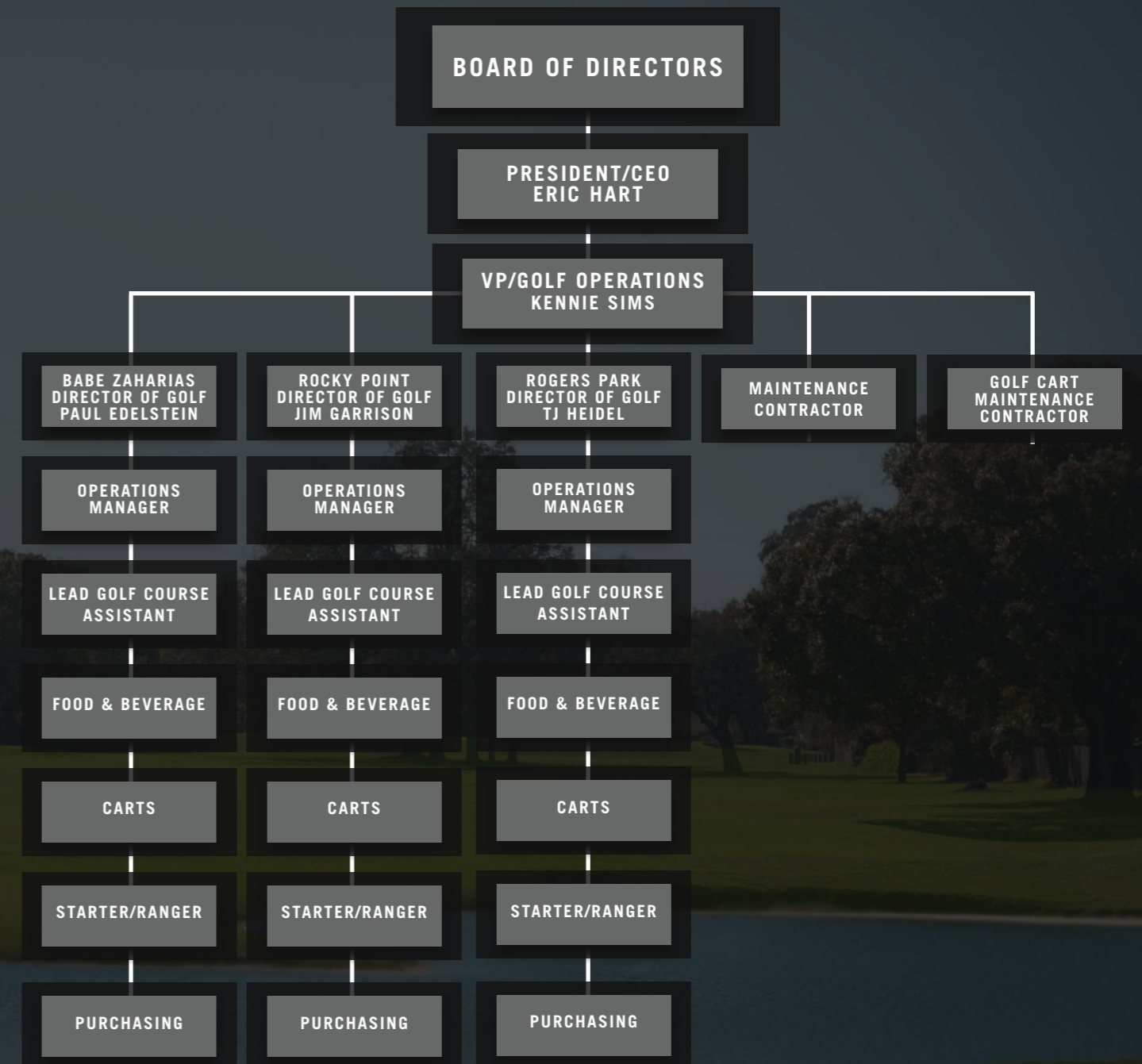
TAMPA SPORTS AUTHORITY: EXECUTIVE TEAM (PICTURED RIGHT)